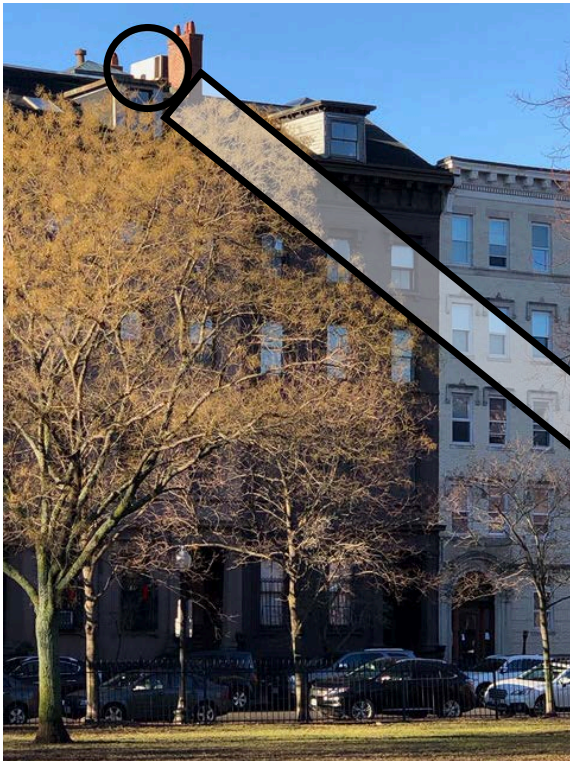
Front Elevation: HVAC Mechanicals to be Relocated